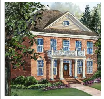
The Granville SOLD

1922 Kirkwood Ridge Drive, Raleigh, NC 5 BRs • 3 Full & 2 Half Baths • 3838 sq.ft