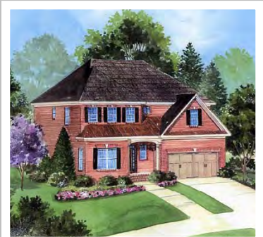
The Creston SOLD

1926 Kirkwood Ridge Drive, Raleigh, NC 4 BRS • 3.5 Baths • 3420 sq.ft.